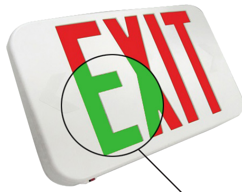
Field-switchable red and green legends

Model: _____ Date: _____ Accessories: _____ Job Name: _____ Type: _____