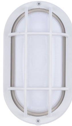
Matt White Housing Frosted Glass Lens