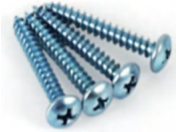
Self tapping screws (Included)