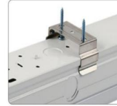
Mounting clips (Included)