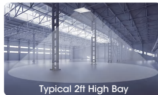
Typical 2ft High Bay