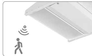
Motion Sensor Available*