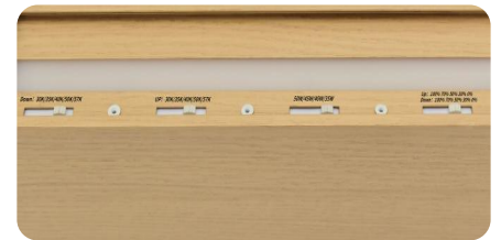
CCT and Wattages Tunable