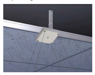
Suspending the luminaire in the T-grid. Compatible for various T-grid, including 9/16" Flat, 9/16" Slot, 15/16" Flat.