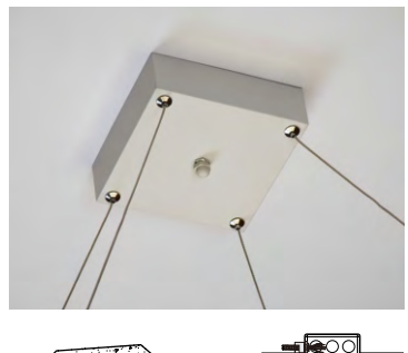
"Various Hard Ceilings" (Mount to J-box)