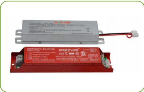
Emergency battery back-up