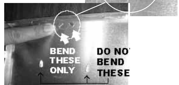
Illustration 3 & 4