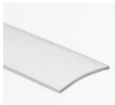
cover type T clear matte (17004)