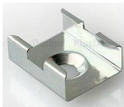
mounting bracket zinc (1072) chrome matt (1345)