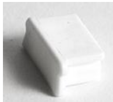
end cap without hole (20051)