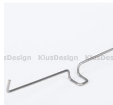
spring PDS (00800)