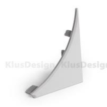
end cap WERKIN-WP (24140) WERKIN-WL (24141)