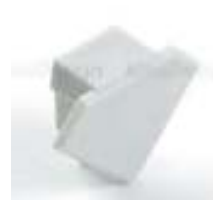
end cap without hole (1383) with hole (1440)