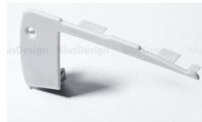
end cap STEP-R, right (00303) STEP-L, left (00304)