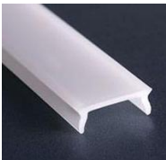
cover type K frosted (1547) transparent (1548)