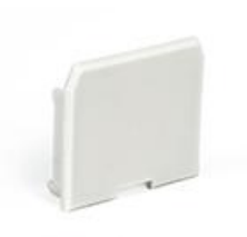
end cap KOZEL without hole (24034)