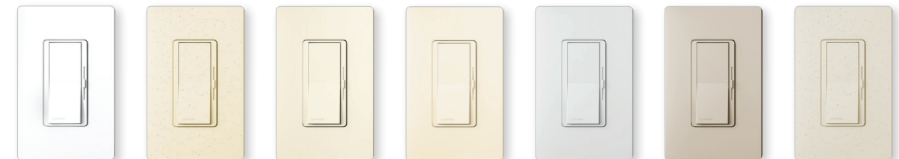
SW Snow LS Limestone BI Biscuit ES Eggshell PD Palladium TP Taupe ST Stone