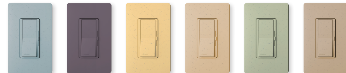
BG Bluestone PL Plum GS Goldstone DS Desert Stone GB Greenbriar MS Mocha Stone