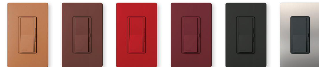
TC Terracotta SI Sienna HT Hot MR Merlot MN Midnight SS Stainless Steel