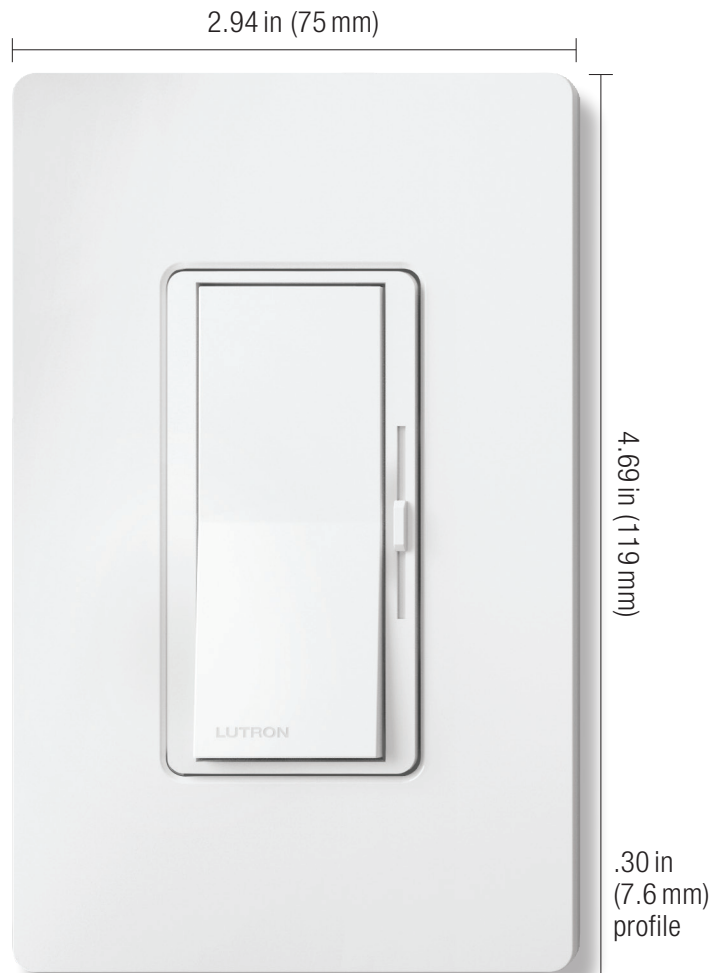
Shown actual size: Diva preset dimmer and 1-gang Claro wallplate in White (WH).