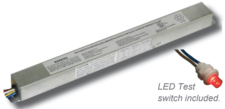
LED Test switch included.