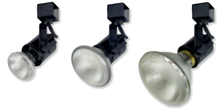
shown with PAR20