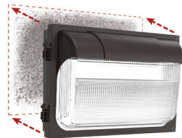
TWX2 LED Wall Pack

Modern low-profile design is less obtrusive on the wall but has a shape that covers the footprint of a typical HID wall pack, covering any unsightly stains.