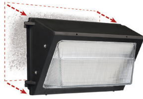
Typical HID Wall Pack