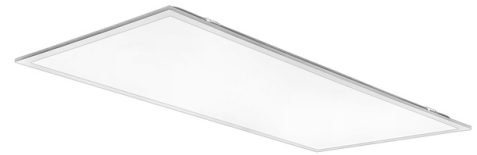
3500K - 5000K

ADD-ONS – Pair with motion sensors, timers, and daylight harvesting systems for hassle free energy savings during the day without needing to worry about manually turning the fixture on and off. Use in conjunction with any 0-10V LED dimmer control to customize lighting level and maximize energy savings. Emergency battery backups are available to ensure up to 90 minutes of lighting in the event of an outage. For more versatile installation options, suspension, surface and recessed mounting kits are available. If using a conventional motion sensor, be sure to replace it with one rated for use with LEDs. While conventional light sensors will still work with LED fixtures at first, they will burn out prematurely. The same is true for motion sensors.