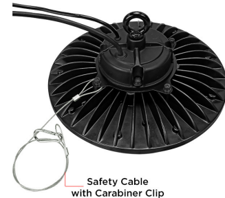
Safety Cable with Carabiner Clip