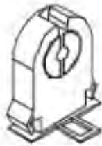
T8 Style lamp holders only available for 8 ft. kit

[1] Shunted lamp holders (L10) are suitable for instant start ballasts, un-shunted (L11) for rapid or pro start ballast