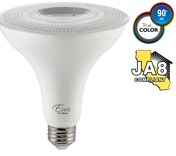
Available only as a twin-pack.