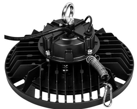
Safety Cable with Carabiner Clip