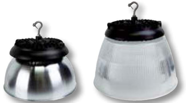
LED Round High Bay with aluminum reflector