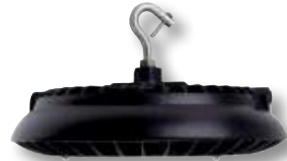
LED Round High Bay