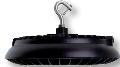
LED Round High Bay

Input Line Voltage ..... 120-277VAC or 347/480VAC Input Line Frequency (Hz) ..... 50/60Hz Wattage (W)..... 80W/100W/150W/200W Lumens (l)..... 13200L/16500L/24750L/33000L Lumens per Watt (LPW)..... >165 LPW Rated Life..... 50,000 hours Minimum Starting Temperature ..... -40°C (-22°F) Maximum Operating Temperature..... 50°C (122°F) CRI ..... >80 Power Factor ..... >0.95 THD..... <20% Surge Protection ..... 4kV Ratings ..... cULus wet location rated, IP65, DLC 5.1 Premium Controls..... 0-10V dimming (standard)