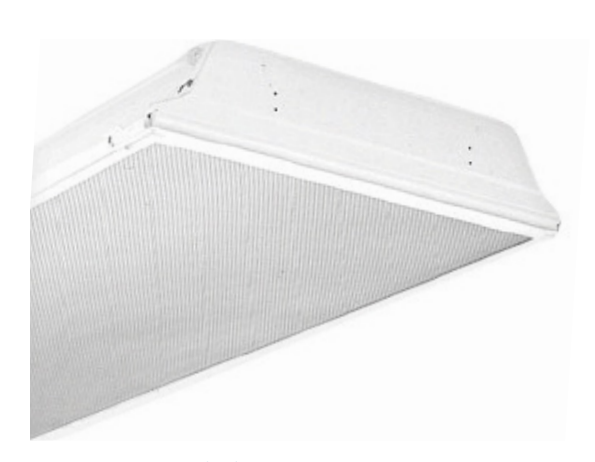
Item#: PLT-20262 LED 2X4 TROFFER - 4 LAMP LED READY FIXTURE