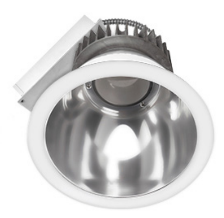
Item#: PLT-20219 LED 8" COMMERCIAL CAN INDOOR FIXTURE