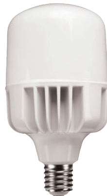
LHID175 E39 base