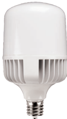
LHID250 E39 base