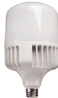
LHID150 E26 base