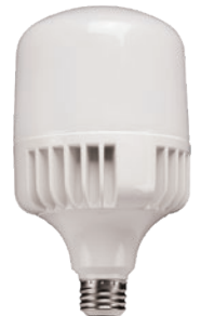
LHID100 E26 base