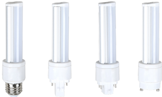
6W E26 6W GX23 6W G24q 6W GU24