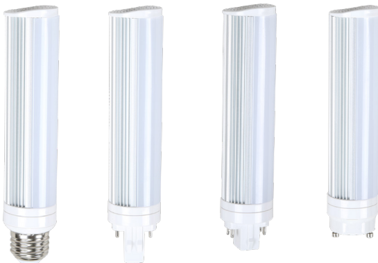
8W E26 8W GX23 8W G24q 8W GU24