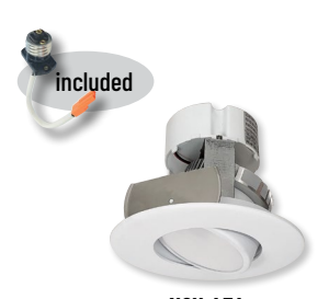
NOX-434 Round Adjustable