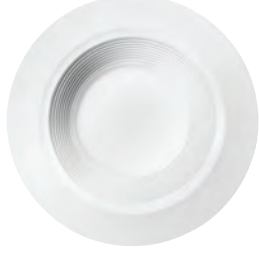
Matte White (MW)