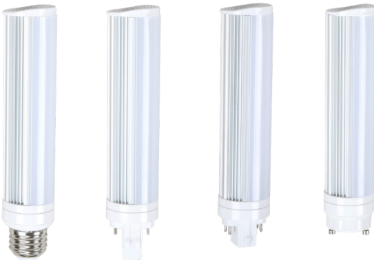
8W E26 8W GX23 8W G24q 8W GU24