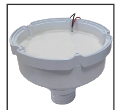
Potted & Baked