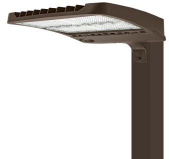
Shorting Cap Included