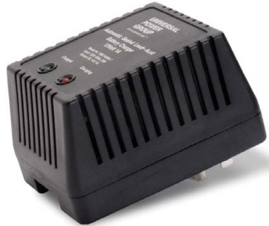
Due to continuous improvements to our products, product images may vary slightly from depiction.