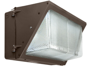
Dimensions Height: 7.63 in. Width: 14.2 in. Depth: 9.25 in. Weight: 8.04 lbs