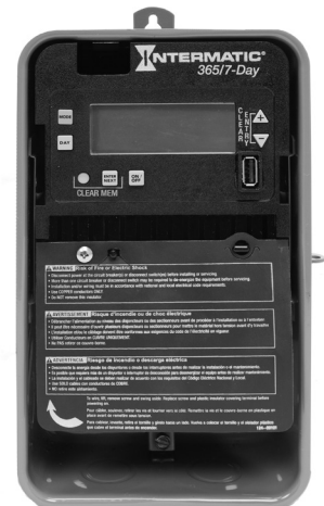
Shown in indoor/outdoor lockable metal enclosure

Follow these instructions to complete the installation and programming of the ET2705 time switch.