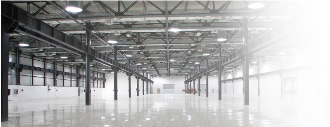
Application illustration only, subject lamps not used in photo.