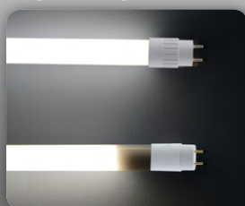
Other LED Tubes