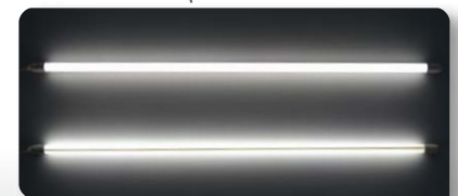
Lamp Back View