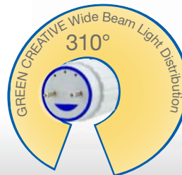
Lamp Front View

This lamp uses an innovative coated glass design that diffuses heat and light more evenly than plastic. As a result of its compact light engine, this lamp produces a light emitting area of 310°. This wider beam angle improves a fixture's total light distribution and creates a more complete lighting effect.