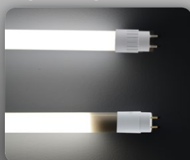
Other LED Tubes