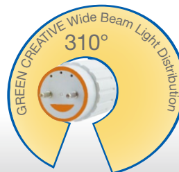
Lamp Front View

This lamp uses an innovative glass design that diffuses heat and light more evenly. As a result of its compact light engine, this lamp produces a light emitting area of 310°. This wider beam angle improves a fixture's total light distribution and creates a more complete lighting effect.