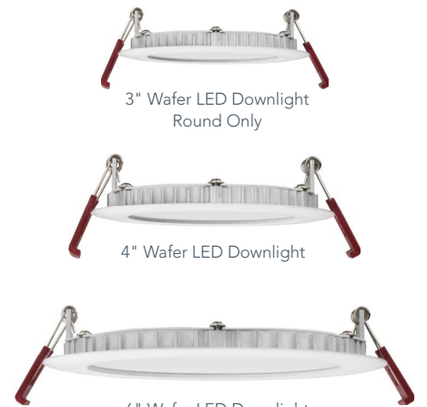
6" Wafer LED Downlight