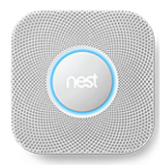
Nest Protect smoke + CO alarm

If Nest Cam detects a person in or around your home when you're not there, lights can turn on to make it look like you're home.