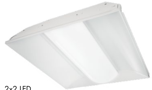
2x2 LED Volumetric Luminaire