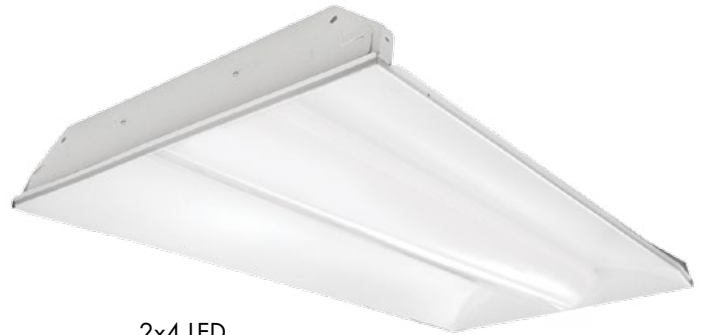
2x4 LED Volumetric Luminaire