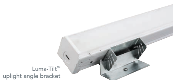
Luma-Tilt™ uplight angle bracket