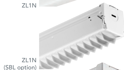
ZL1N (SBL option)