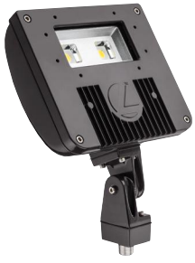
THK - Knuckle with 1/2" NPS threaded pipe