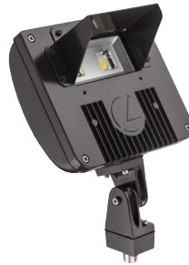
UBV - Upper/bottom visor W= 5-1/4" (13.3 cm) H= 2-1/2" (6.3 cm) D= 3" (7.6 cm)