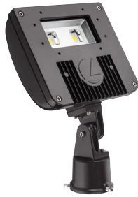
IS - Integral slipfitter H= 2-1/2" (6.3 cm) ID= 2-3/8" (6.0 cm) OD= 3-1/2" (8.8 cm)