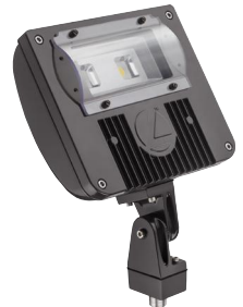
VG - Vandal guard W= 6-1/2" (16.5 cm) H= 4" (10.1 cm)