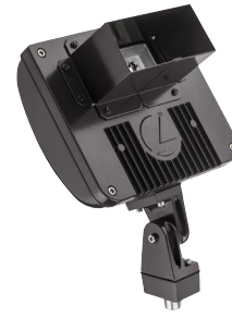
FV - Full visor W= 5-1/4" (13.3 cm) H= 2-1/2" (6.3 cm) D= 3" (7.6 cm)