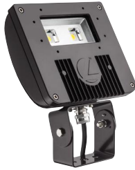
YKC62 - Yoke with 50 cord H= 4-1/4" (10.7 cm) D= 2-1/4" (5.7 cm)