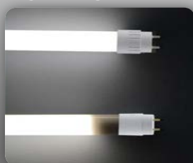
Other LED Tubes