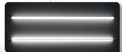
Lamp Back View