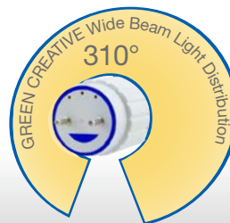
Lamp Front View

This lamp uses an innovative coated glass design that diffuses heat and light more evenly than plastic. As a result of its compact light engine, this lamp produces a light emitting area of 310°. This wider beam angle improves a fixture's total light distribution and creates a more complete lighting effect.