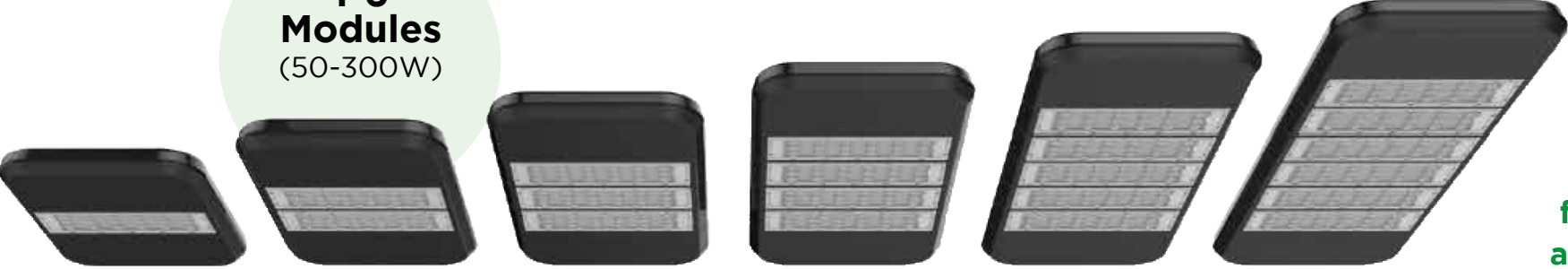
1-6 Modules (50-300W)