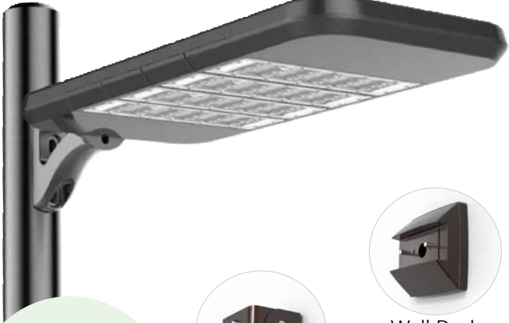
Mounting Options for Area, Flood and Wall