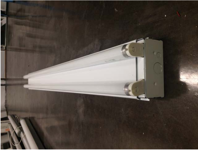
← Strip fixture with T8 bulbs and ballast