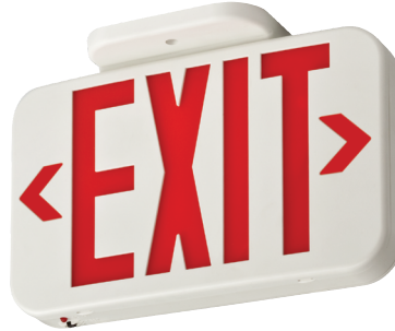
EXR LED EL