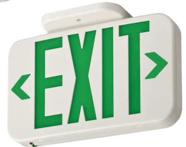
EXG LED EL