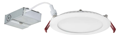
3" Wafer LED Downlight Round Only