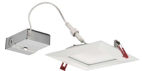
4" Wafer LED Downlight